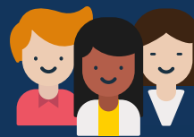
Inclusive to every patient group