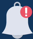
Real time alerts to flag critical issues