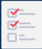
'Patients first' survey channels

Healthcare Communications FFT solution was rolled out trust wide across their 400+ services, enabling staff to benefit from the following features: