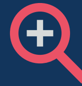
Big picture view or drill down into details