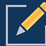
Access feedback specific to ward or department