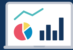
Interactive dashboard and auto reporting